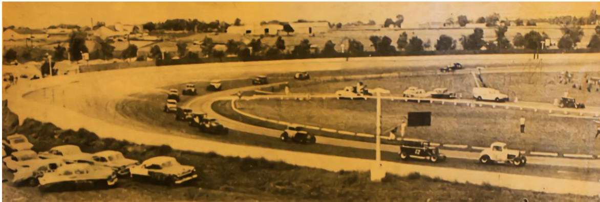
Early Model Mods at the Minnesota State Fair – coming out of turn four