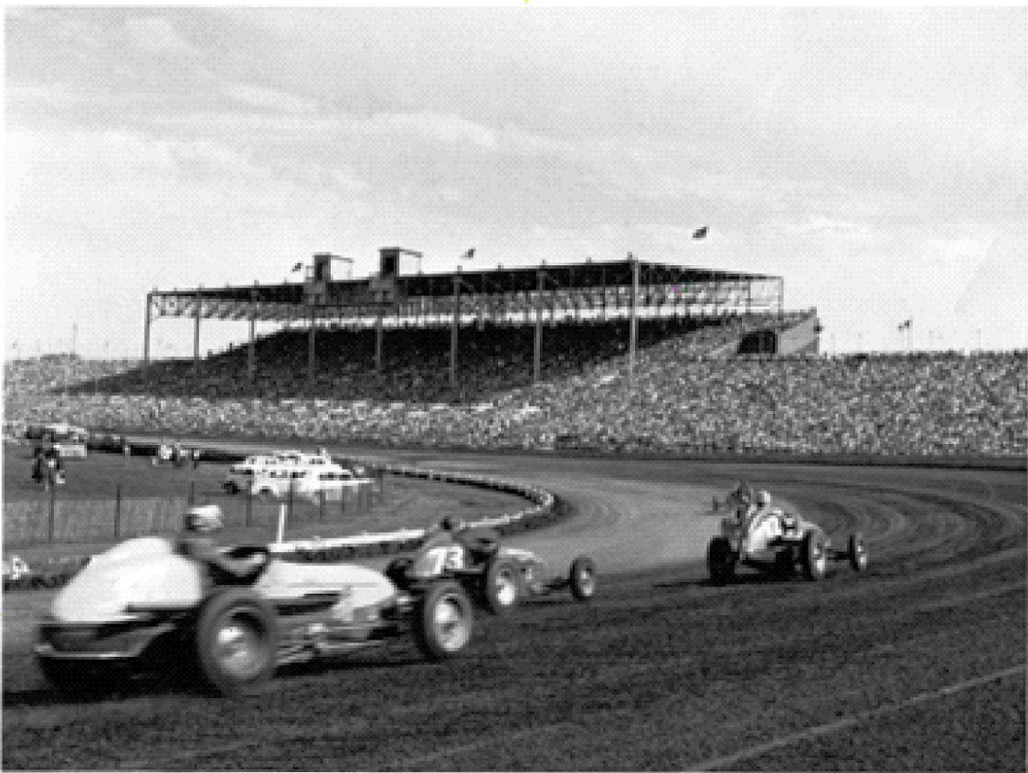
Sprint cars at the Minnesota State Fair