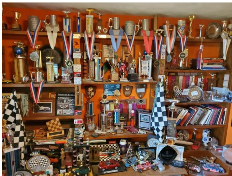
The West's Trophy Room